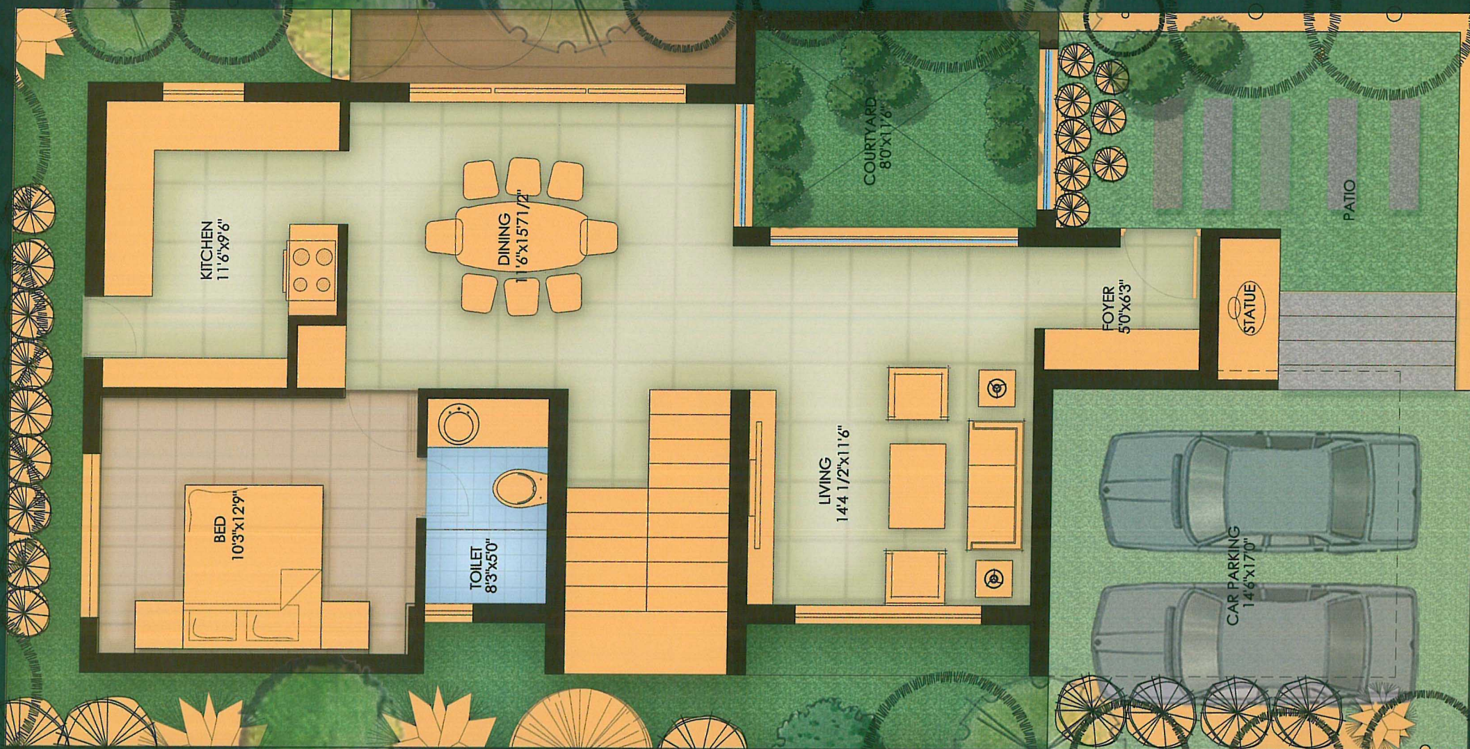
FLOOR PLAN - VILLA TYPE A (GROUND FLOOR)