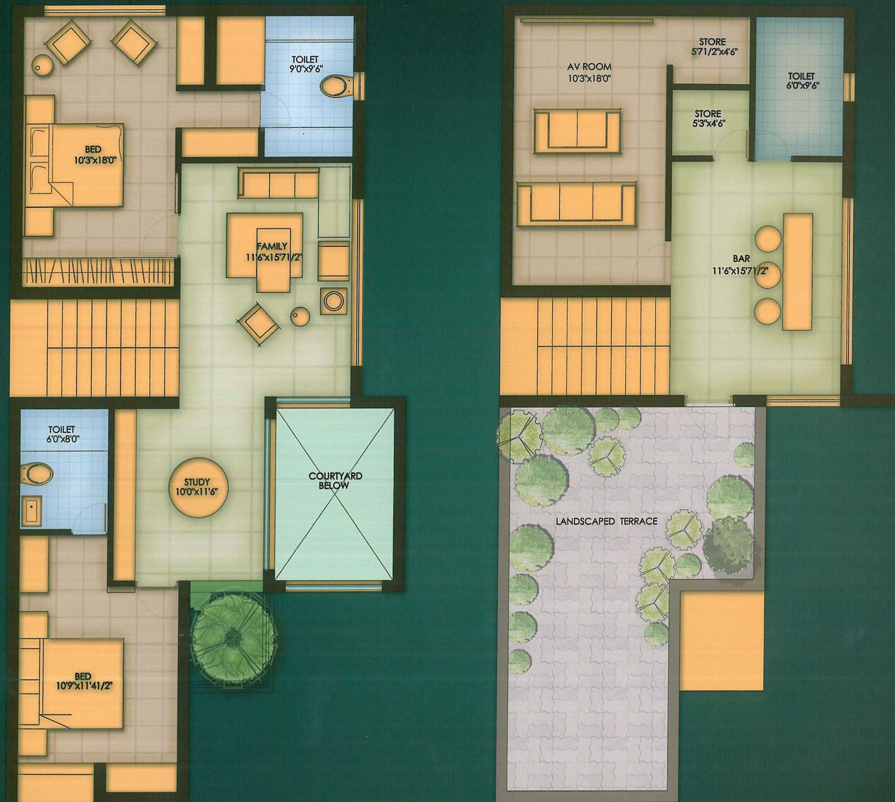
FLOOR PLAN - VILLA TYPE A (FIRST FLOOR / SECOND FLOOR)