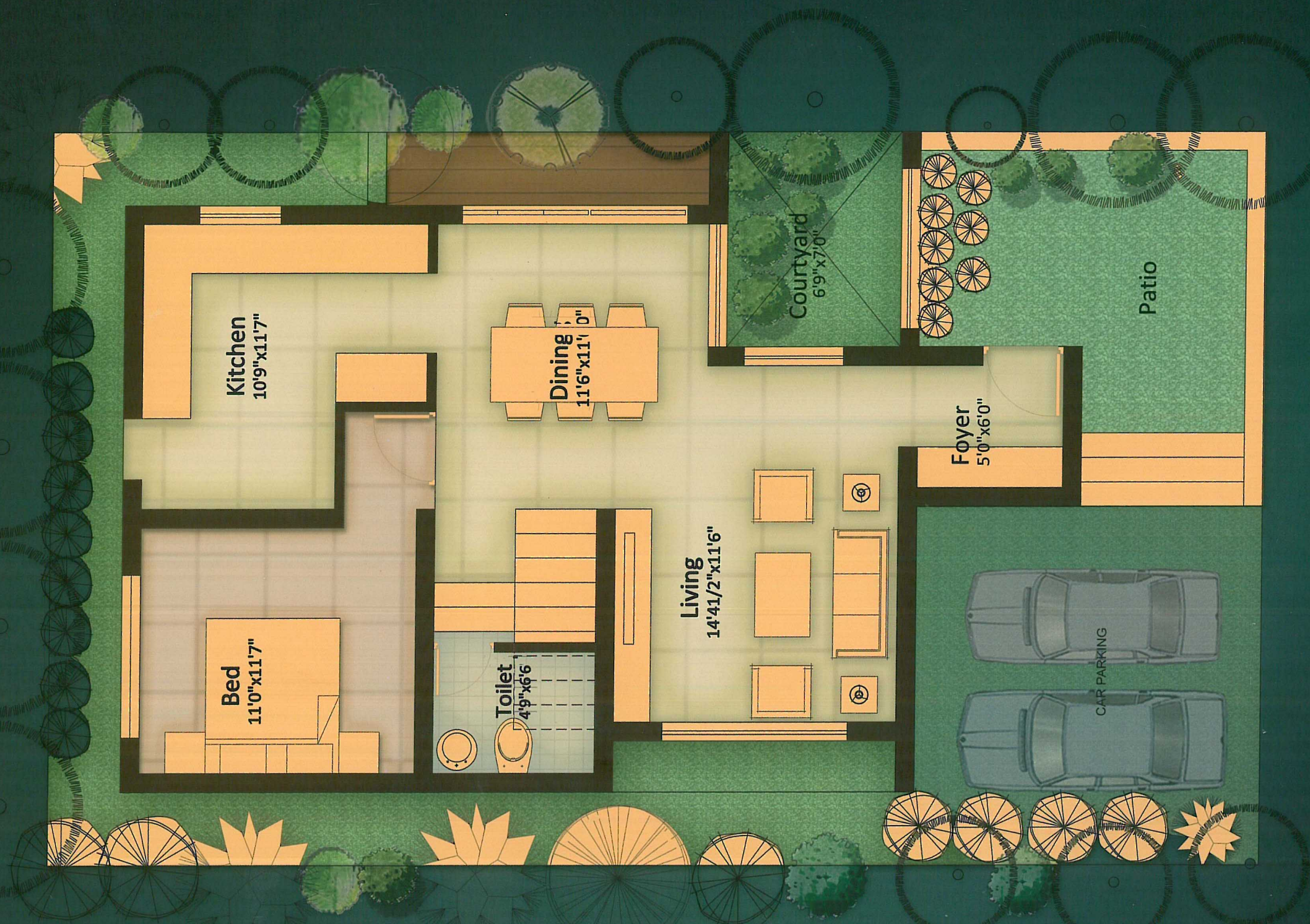
FLOOR PLAN - VILLA TYPE B (GROUND FLOOR)