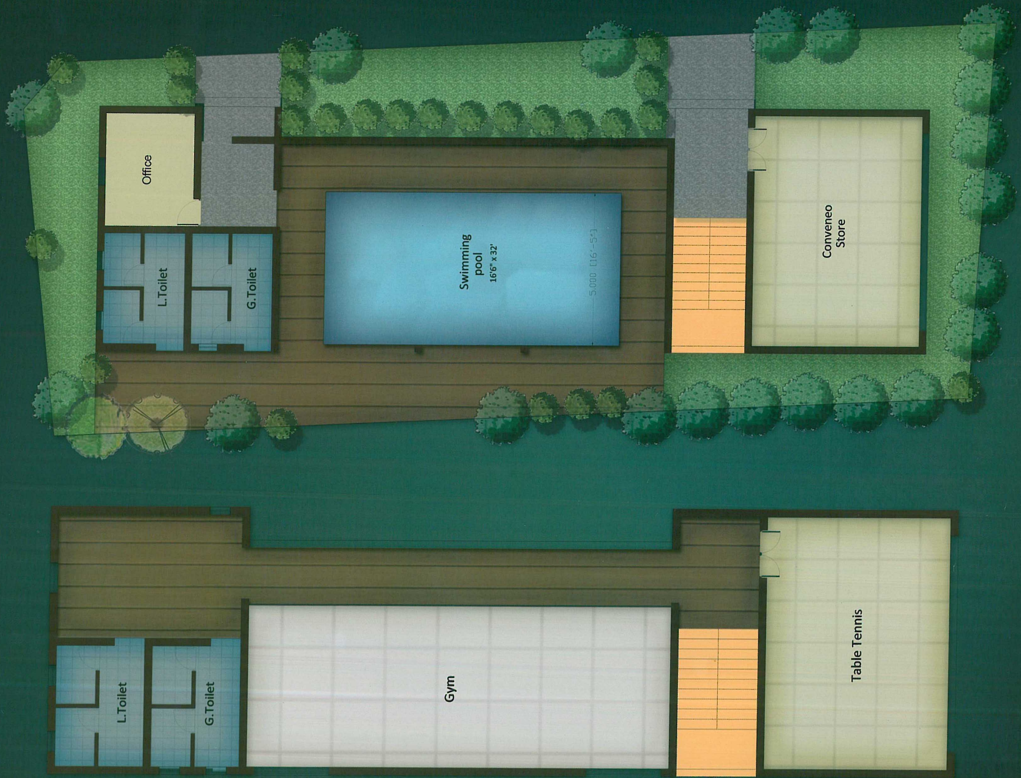
CLUB HOUSE (GROUND FLOOR / FIRST FLOOR)