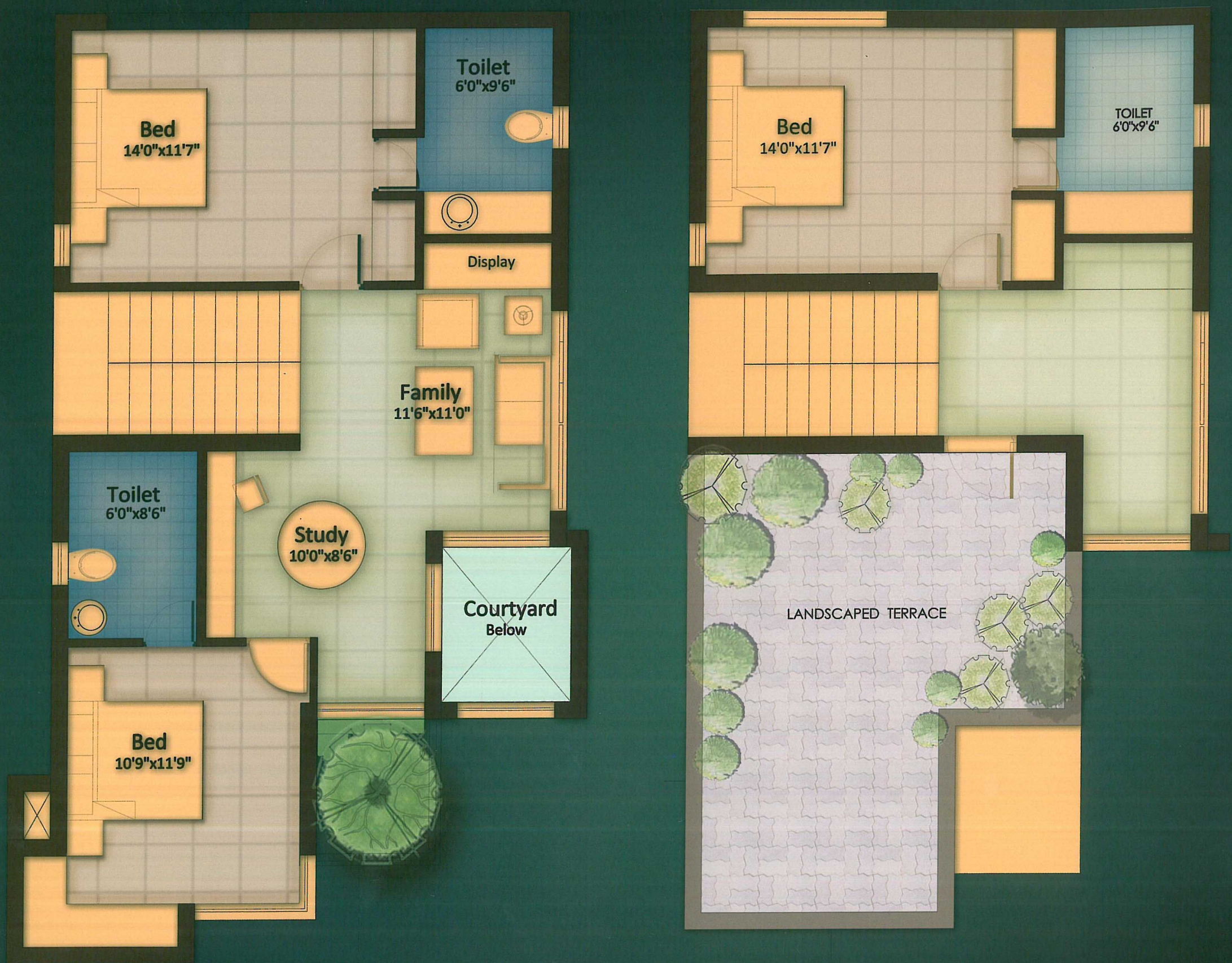
FLOOR PLAN - VILLA TYPE B (FIRST FLOOR / SECOND FLOOR)